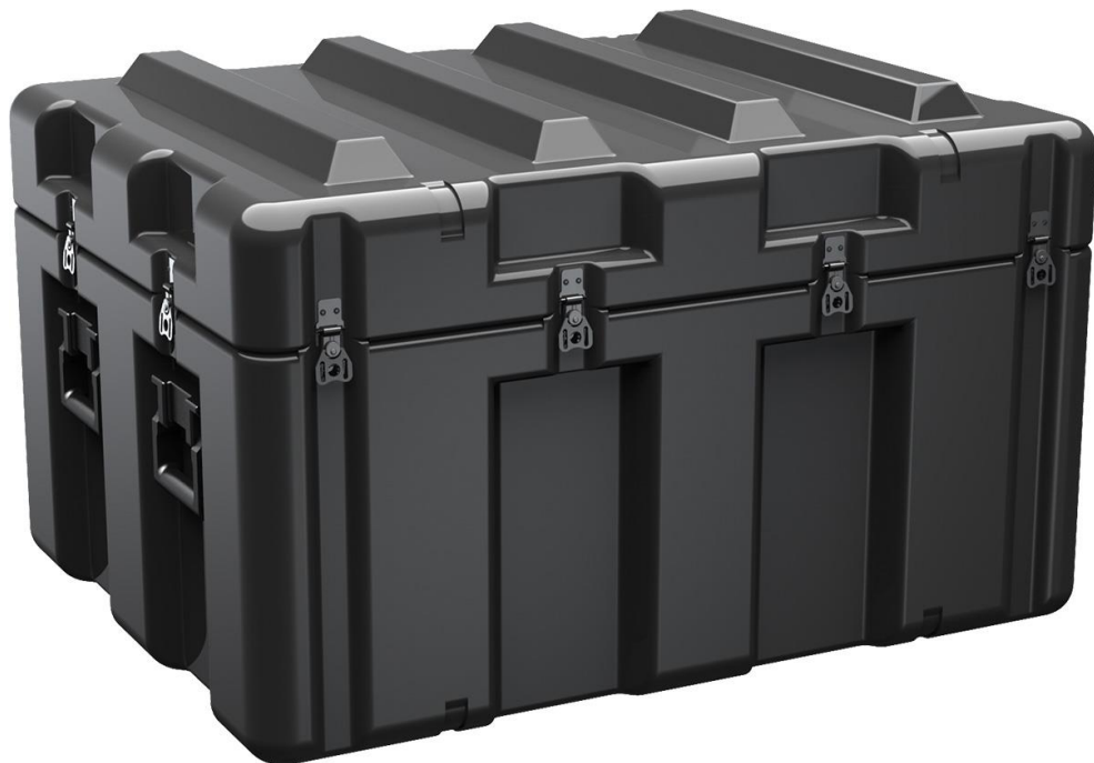
CASE TOOL AND ACCESSORIES W FOAM CUTOUTS PART # AL3627-1505-16045-200 NSN 5140014822325