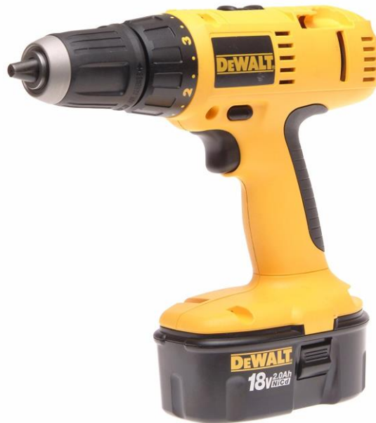
DRILL DRIVER ELECT CORDLESS 18 V INCL CHARGER 2 BATTERIES CASE PART # DW995K-2 NSN 5130014596060

This lightweight, dry pickup-only vacuum features a single-stage motor for powerful pickup and a dent-resistant, rustproof tank to withstand tough use