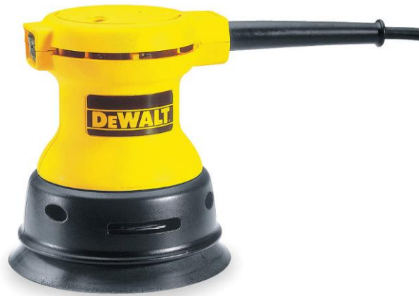
SANDER DISK ELECTRIC PORTABLE 5" HD AC ONLY RANDOM ORBIT PART # DW420 NSN 5130014486702

Palm grip; random orbital; 2 amp; 12000 opm; pressure sensitive adhesive pad; dust sealed switch; double insulated