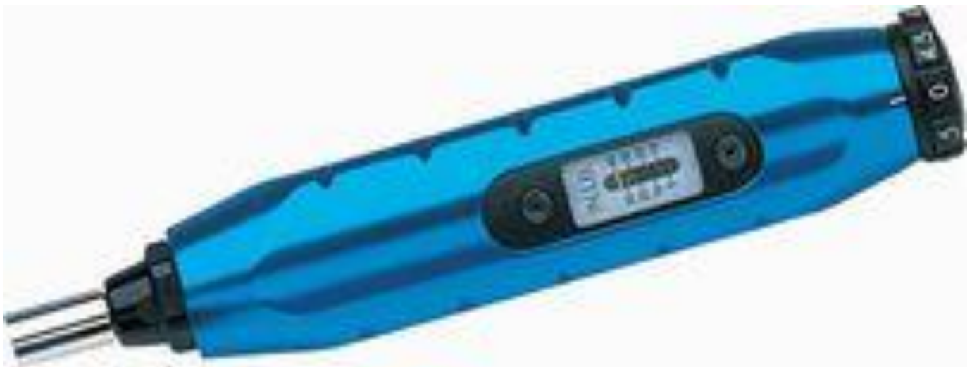
SCREWDRIVER, TORQUE PART # TQSC6A NSN 5120011129532

Palm grip; random orbital; 2 amp; 12000 opm; pressure sensitive adhesive pad; dust sealed switch; double insulated