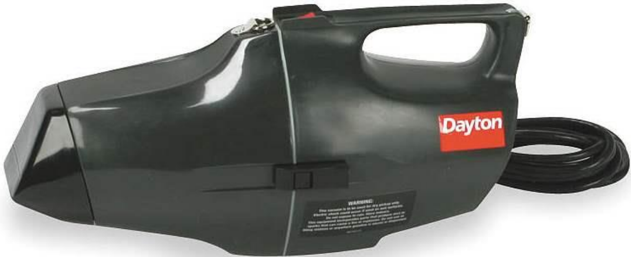
CLEANER VACUUM ELECTRIC 3FT HOSE 18FT CORD NOZZLE & CREVICE TOOL PART # 4Z906 NSN 7910014773836

This lightweight, dry pickup-only vacuum features a single-stage motor for powerful pickup and a dent-resistant, rustproof tank to withstand tough use